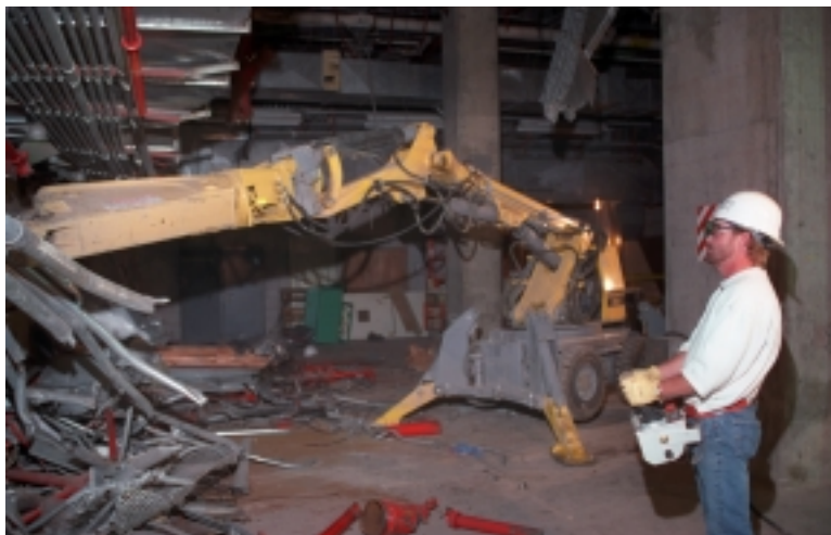
Figure 3: The Brokk 250 and a D&D operator in demolition activities.

During 1997–1998 a Brokk 250 was purchased by the INEEL LSDDP for a comparison of performing manual versus remote D&D activities, such as concrete sizing and removal. The Brokk family of demolition equipment is manufactured by Holmhed Systems AB of Sweden and uses a teleoperated, articulated, hydraulic boom with various tool-head attachments. The Brokk 250 consists of a revolving table, capable of continuous rotation, mounted on a tractor-like base. Solid rubber wheels mobilize the equipment, and hydraulic outriggers extend beyond the tires to add stability during operation. The unit requires a 480-V ac, 50-A circuit for its power source. Someone can operate the Brokk from 400 ft away using either a tethered portable controller or a wireless radio frequency (rf) portable controller. In the baseline mode, the Brokk is controlled by an operator standing in relatively close proximity of the machine with line-of-sight vision of the work site. Figure 3 shows the Brokk BM 250 being used for D&D activities while using the wireless rf controller.