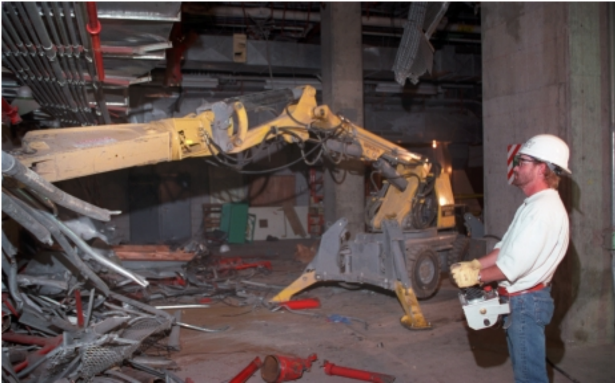
Figure 1: The Brokk 250 and a D&D operator in demolition activities.

During FY 2000, the D&D Rbx Product Line Manager working with the INEEL Rbx D&D group modified this Brokk 250 to allow remote capability from the CRC, which was developed by ORNL. Figure 2 illustrates the modified Brokk 250 and the CRC. This Modified Brokk Demolition Machine with Remote Console was demonstrated and deployed during D&D activities at the INEEL STF in January 2000.