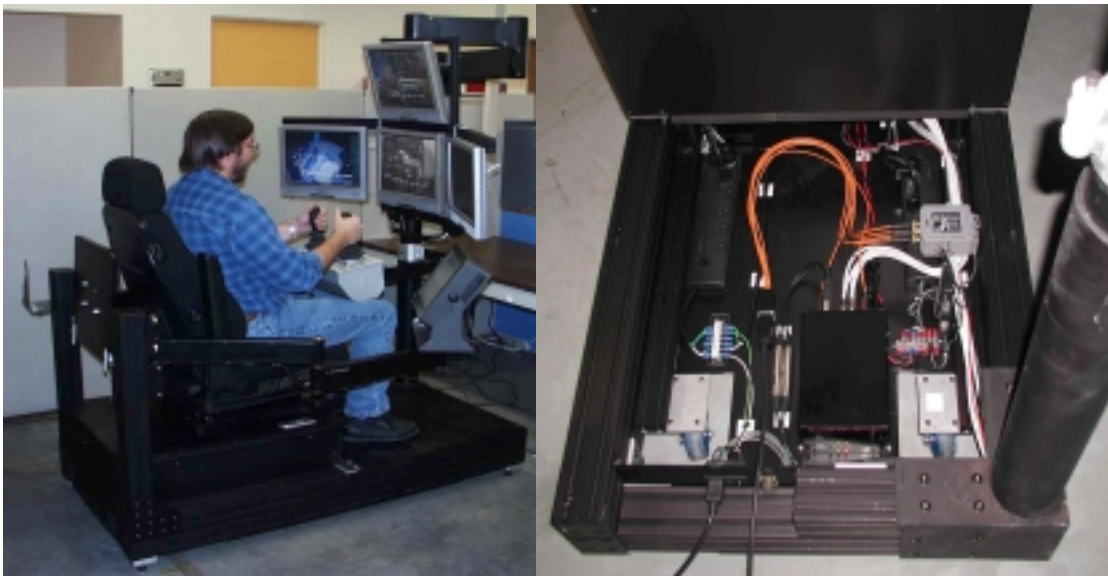
Figure 7: The CRC and inside its base enclosure.

The purpose of the CRC is to condense a typical multi-monitor, multi-rack large operator control console into a single, easy-to-relocate ergonomic station. The CRC measures 30 in. wide by 61 in. long and 76 in. tall and consists of a 4-panel video array, which is mounted on a mast in front of an ergonomic chair. These are subsequently mounted on a base, which serves as an enclosure for associated power, video switchers, and control and fiber-optic electronics. Also mounted on a swivel arm on the CRC is a control computer with a touch-screen, which serves as an intuitive graphical user interface (GUI) to the Modified Brokk Demolition Machine. Figure 7 shows the CRC with an integrated portable Brokk 250 controller and an inside view of the base enclosure. For an in-depth, detailed discussion of the CRC, see ITSR OST/TMS ID 2180, "Compact Remote Operator Console", August 2000.