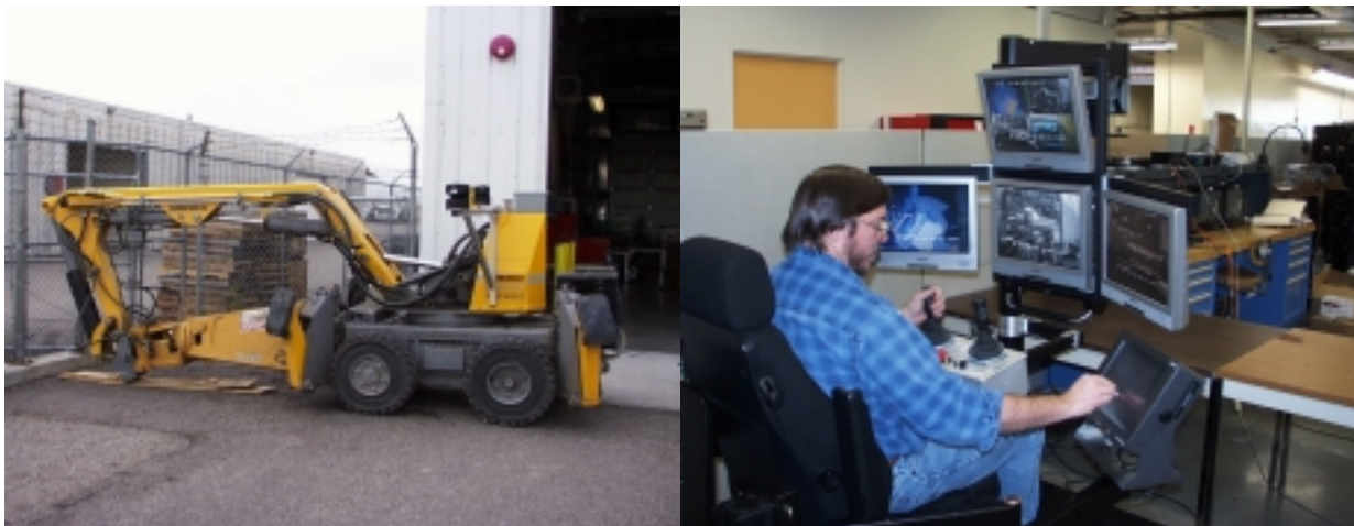
Figure 2: INEEL Modified Brokk 250 and the ORNL CRC.

During FY 2000, the D&D Rbx Product Line Manager working with the INEEL Rbx D&D group modified this Brokk 250 to allow remote capability from the CRC, which was developed by ORNL. Figure 2 illustrates the modified Brokk 250 and the CRC. This Modified Brokk Demolition Machine with Remote Console was demonstrated and deployed during D&D activities at the INEEL STF in January 2000.