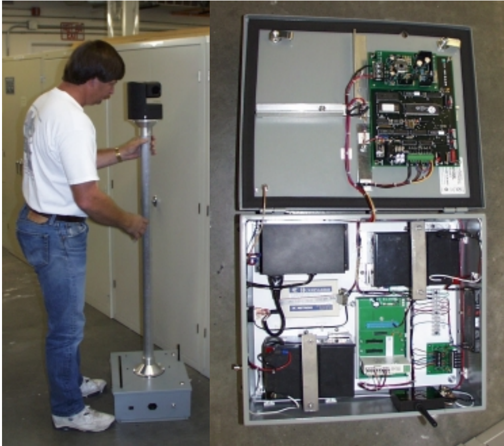
Figure 5: The Facility Camera with its electronics enclosure.

An auxiliary camera system was developed, which can be placed anywhere in the facility, and which can be used for remotely viewing work activities from a different perspective. This system was developed using a third DRaySEE™ camera system, which was mounted on a 5-ft pole and enclosure. Located in the enclosure are rechargeable batteries, a battery recharging system, and electronics, which allow rf or hard-wired video transmission. Figure 5 illustrates the facility camera and the electronics enclosure.