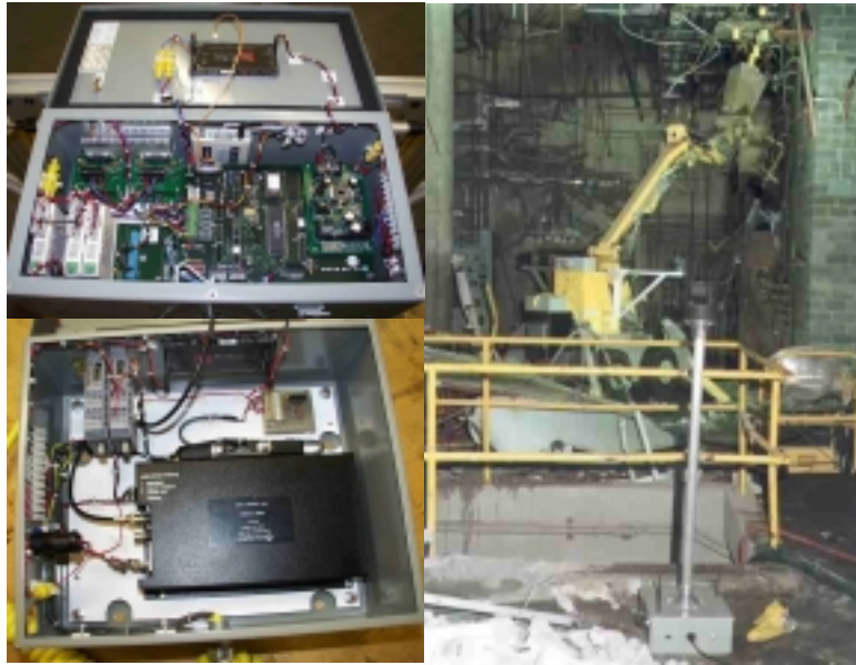
Figure 6: Electronics enclosures and the Modified Brokk 250 with enclosures mounted.

The purpose of the CRC is to condense a typical multi-monitor, multi-rack large operator control console into a single, easy-to-relocate ergonomic station. The CRC measures 30 in. wide by 61 in. long and 76 in. tall and consists of a 4-panel video array, which is mounted on a mast in front of an ergonomic chair. These are subsequently mounted on a base, which serves as an enclosure for associated power, video switchers, and control and fiber-optic electronics. Also mounted on a swivel arm on the CRC is a control computer with a touch-screen, which serves as an intuitive graphical user interface (GUI) to the Modified Brokk Demolition Machine. Figure 7 shows the CRC with an integrated portable Brokk 250 controller and an inside view of the base enclosure. For an in-depth, detailed discussion of the CRC, see ITSR OST/TMS ID 2180, "Compact Remote Operator Console", August 2000.