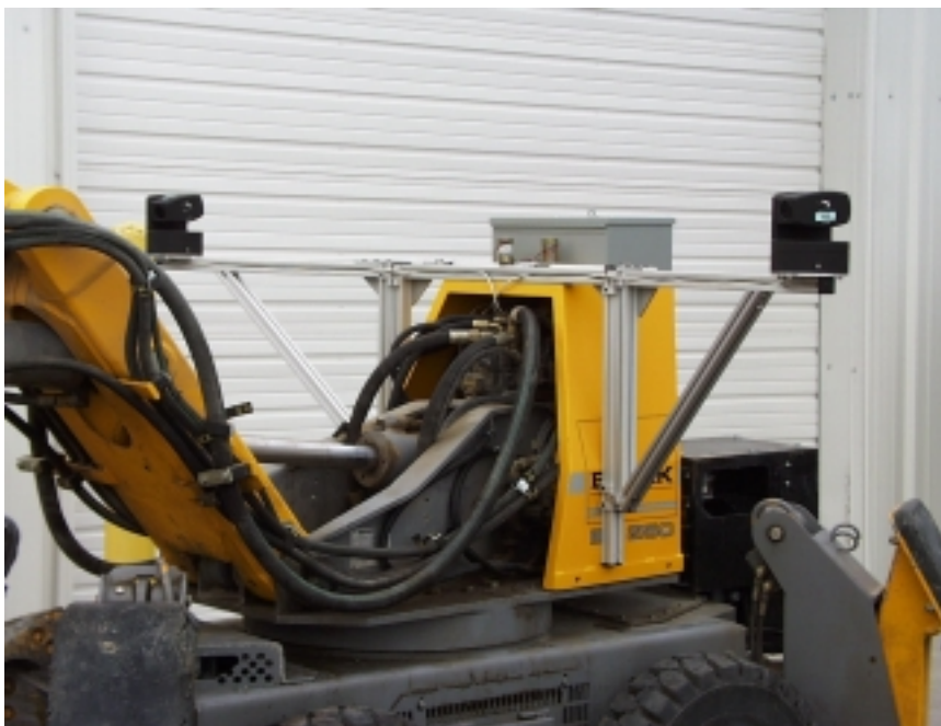
Figure 4: The Brokk 250 with cameras and actuated arms deployed.

In order to perform D&D activities from a truly remote non-line-of-sight location, the Brokk 250 was retrofitted with two image-stabilized cameras mounted in a pan-and-tilt aluminum enclosure. The image-stabilized DRaySEE™ camera system is commercially available from RVision, Inc., and produces 350 lines NTSC video, pans 360°, tilts 110°, and provides 24 times image magnification (12X optical). The 12-V dc system requires separate power for the pan-and-tilt functions and a serial interface to control camera zoom features. These two cameras were mounted on two actuated arms, which are located on the Brokk 250's cover, as shown in Figure 4. The actuated arm system allows the cameras to be positioned in the optimal viewing position during work activities and to be retracted while the Brokk is being moved throughout the remote area. By mounting the camera and actuator system on the cover, the Brokk 250 can easily be changed from remote-camera ready to original equipment by simply interchanging covers.