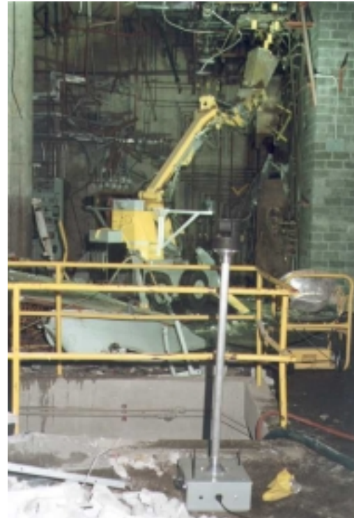
Figure 8: The D&D Operator at the CRC and the Modified Brokk in D&D activities.

At the conclusion of the 2-day field trial, operator feedback was obtained to determine the strengths and weaknesses of the system. At the request of the D&D site operations and with the permission of the Rbx D&D Product Line Manager, the Modified Brokk Demolition Machine was left for an additional 3 days to allow the remaining listed D&D tasks to be completed from the remote control station. The operators were so pleased with the system and found that it impacted the schedule less than anticipated that they preferred the ease and comfort from the CRC to the cold wet basement of the STF. Additionally, a media event with local news stations was conducted at the end of the 5 days to present the capabilities of the new Modified Brokk Demolition Machine with Remote Console operating in the field at the STF.