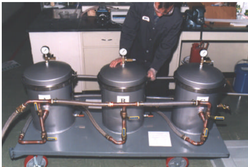
Figure 2. Selective Separation Cartridges vessels in series.

The Selective Separation Cartridges are deployed in a system that includes a pump, filter vessels, active filter cartridges, plumbing, valves, and gauges. The system is small enough that the components can be carried on small utility carts. A 10-15 gpm system is shown in Figure 2 below. Because the requirement for each application differs, there are a variety of systems that may be provided with the cartridges. The simplest system is an arrangement of vessels in series: water enters at one end and passes through a vessel (or series of vessels) containing prefilters for solids removal, and then through active cartridges for radionuclide removal, exiting the opposite end of the system. Vessels may contain single cartridges or multiple cartridges in a “nested” arrangement. The combination of large, nested cartridges and a redirectable flow system provides high flowrate and continuous operation.