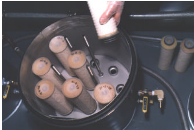
Figure 1. Selective Separation Cartridges in nested arrangement.

At the time this report was written, membranes for the removal of Uranium (U) and Plutonium (Pu) were under development.