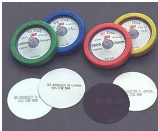
Figure 5. Rapid Liquid Samplers and Empore™ Rad Disks

3M has also developed a similar membrane technology, called Empore™, for aqueous sampling and analysis applications. The RLS is designed for rapid and economical field sampling of heavy metal and radionuclide contaminants. The sampling system is field-portable, rugged and user friendly. A disk from the RLS is pictured in Figure 5. The RLS technology is described in an ITSR entitled Rapid Sampling Using 3M Membrane Technology, January 2000. The RLS has been used during most of the demonstrations and deployments of the Selective Separation Cartridges.