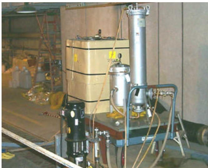
Figure 4. System at SRS with two particulate pre-filters and lead-shielded cartridge vessel.

The Sr-removal cartridge worked effectively, reducing the concentration of Sr-90 from an influent concentration of 23,500 pCi/L, to an effluent concentration less than 100 pCi/L. The 22-nested cartridges were replaced after 50 percent breakthrough was observed. Two sets of cartridges were used during the Sr-90-removal phase. The first set of 22 filters processed approximately 11,500 gallons before breakthrough and the second set of filters processed 11,750 gallons before breakthrough. The capacity of the Sr-cartridge was reduced by the presence of Ca, a competing ion. This occurrence was not unexpected based on the concentrations of CaCO 3 in the basin.