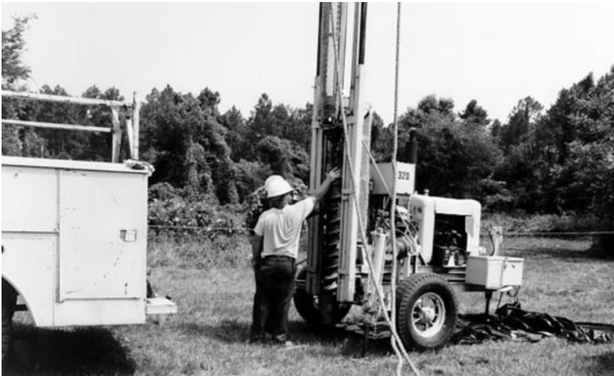
Figure 1. Immediate data analyses are completed using field mobile equipment as shown here at the Savannah River Site.

The ESC methodology emphasizes the delineation of the hydrogeologic framework of the potentially contaminated site, followed by the delineation of the contaminant pathways and contaminant distribution, and the selection of the most effective measurement technologies. Explicit in the process is direct communication with regulators and stakeholders.