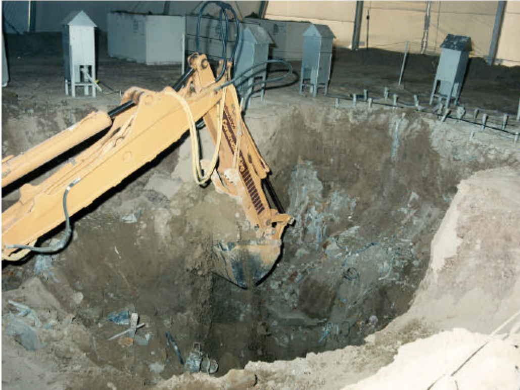
Figure 2. Excavation of monolith.