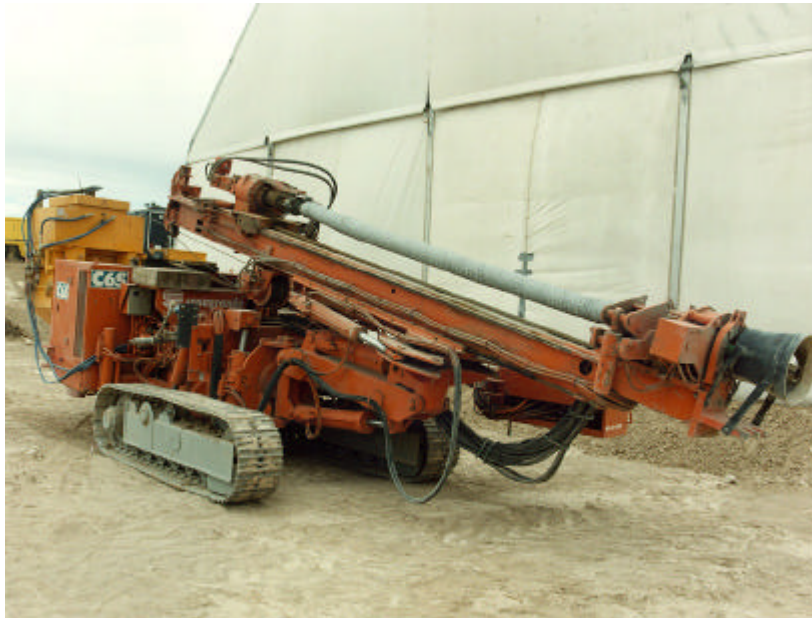
Figure 1. The CASA Grande drill system.

Figures 1 and 2 show the jet grouting and excavation equipment that can be used in each of the preceding applications. Figure 3 shows the application of demolition grout, which is used in the innovative grout/retrieval technology application.