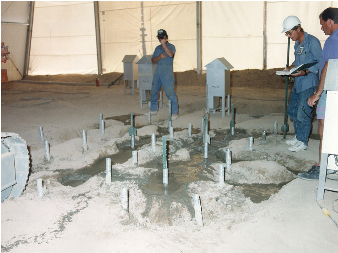
Figure 3. Grouted pit with spiral-wrapped tubes.