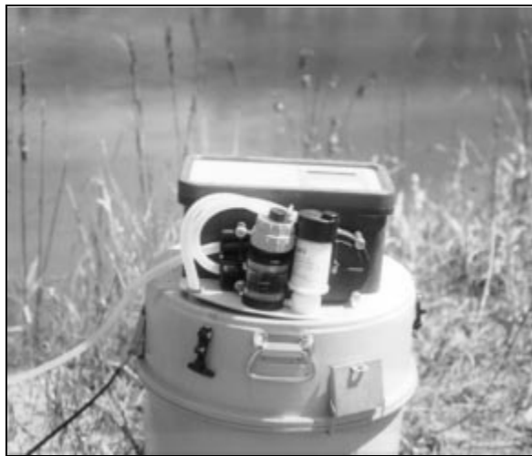
Figure 1. 3M Empore™ filter.